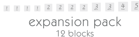
expansion pack 12 blocks